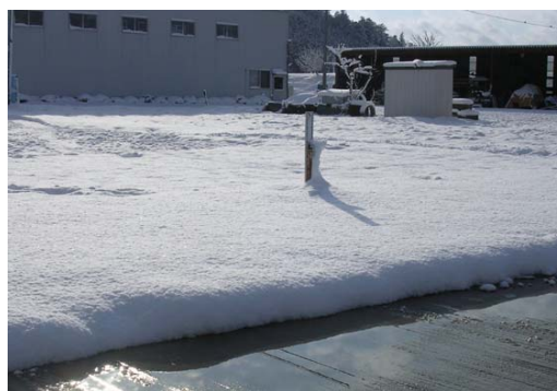
The ICAX technology has been licensed by Misawa in Japan for this experimental site at Hiroshima, where the area to the front of the picture is being kept free from ice and snow using heat captured during the Summer.

The IHT technology had been proved to work in the near-laboratory conditions of a roadway, and Howe Dell provided a chance to roll it out in a building project. The design was subjected to computer modelling to check that